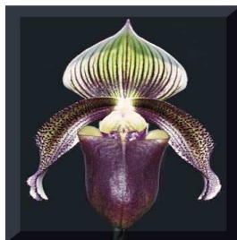
Paphiopedilum curtisii 'Dark Warrior'

You're never too old to learn, and the New York Botanical Garden is having their 2008 American Gardening Winter Lecture Series throughout February and March. Saturday March 1st offers a variety of classes geared to the understanding of the soil and how to modify it for different plant material. Or you might want to sit in and see what Spring Maintenance in the garden consists of. Later in the day it's time to familiarize yourself with expanding your knowledge on early flowering bulbs and other plants or find out about dividing and transplanting what is in your garden now. The afternoon brings the option of learning what to prune and when or getting serious and beginning with seeds as the first step in plant production. March 29th has classes solely on Native Plants - perennials and woody. Learning the difference and what makes some plants invasive is also offered. For more information, times and costs, you can go online at www.nybg.org or call 718-817-8747.