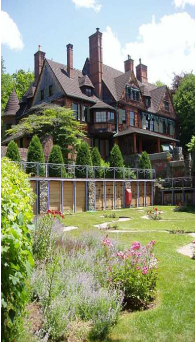
A View of Naumkeag