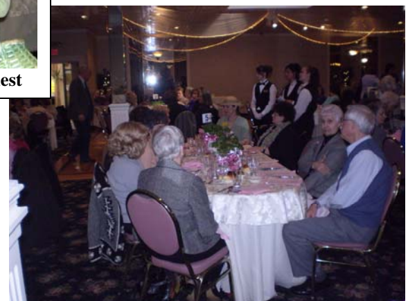
When we're not gardening, that is!