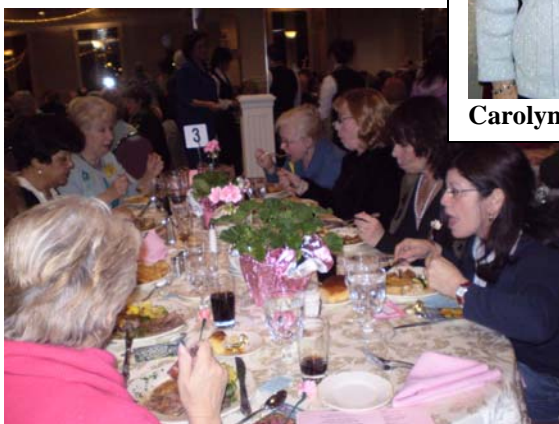
And here we are doing what we do best – eating and drinking and socializing .....